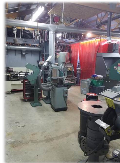
Small view of our abrasive shop

We love hearing from people interested in having small jobs done as well as companies looking for a new manufacturer. If you are someone who thinks there is a service Innovative could provide, please don't hesitate to call!