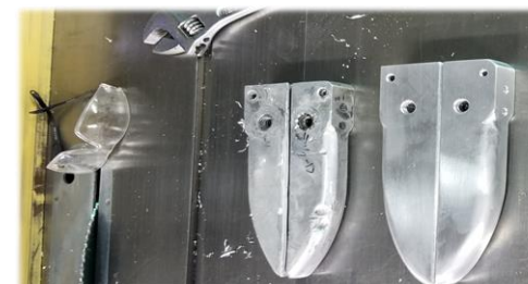
Sample of duplicating a worn-out part

We have in our shop what we call a “dirty shop” which is equipped with a welding room, a sand/glass blasting area, several types of sanders including a wet sander, spindle sander and a stroke sander, several polishing wheels, a JET lathe used for polishing, and much more.