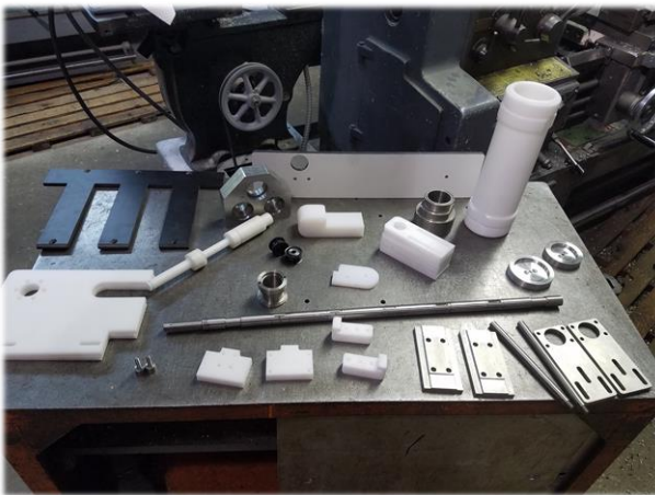
Sample of some replacement parts